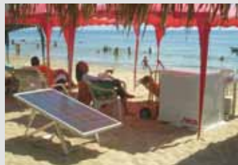
Cooled drinks, Caribbean